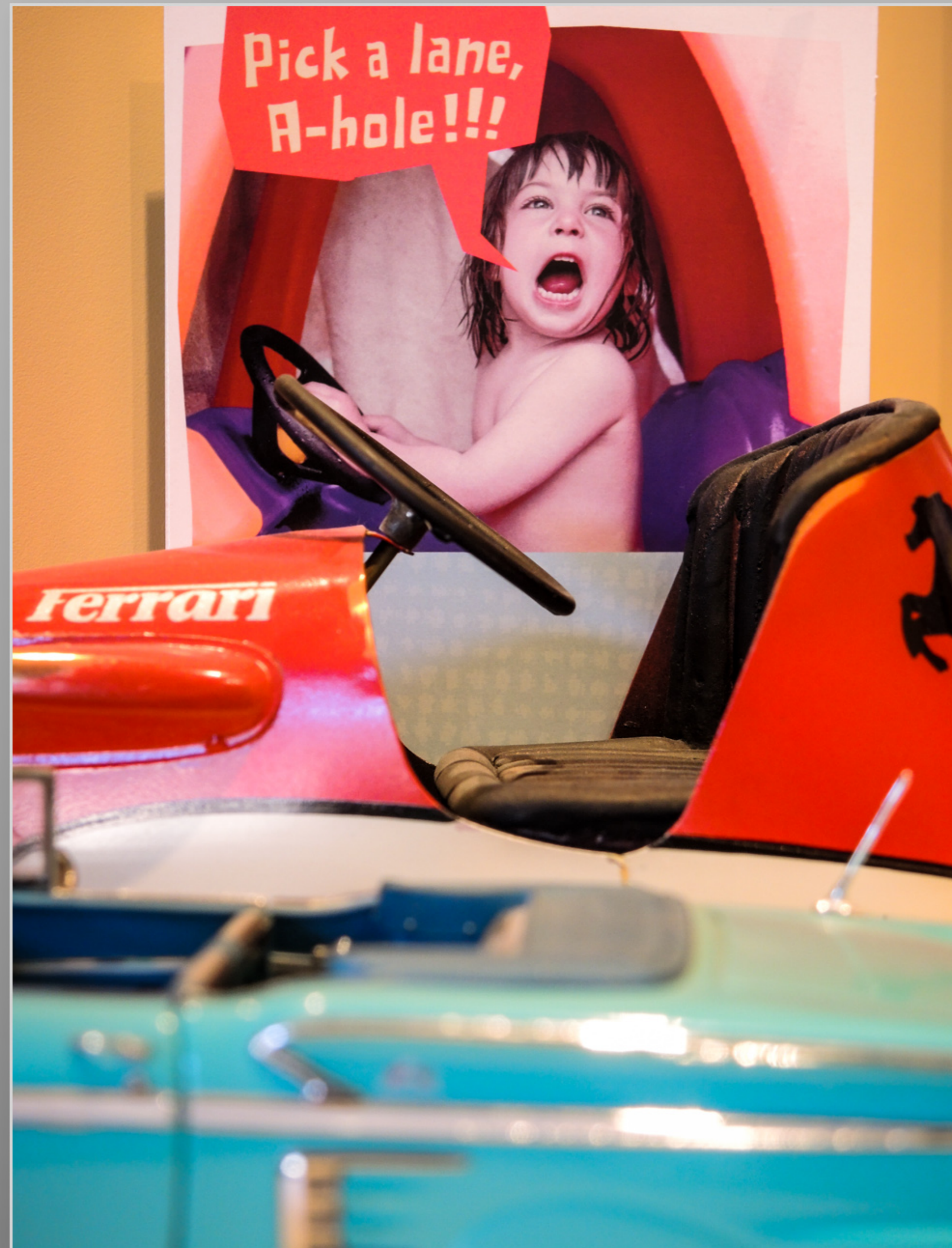
Pick a Lane...aligning other model cars with greeting card