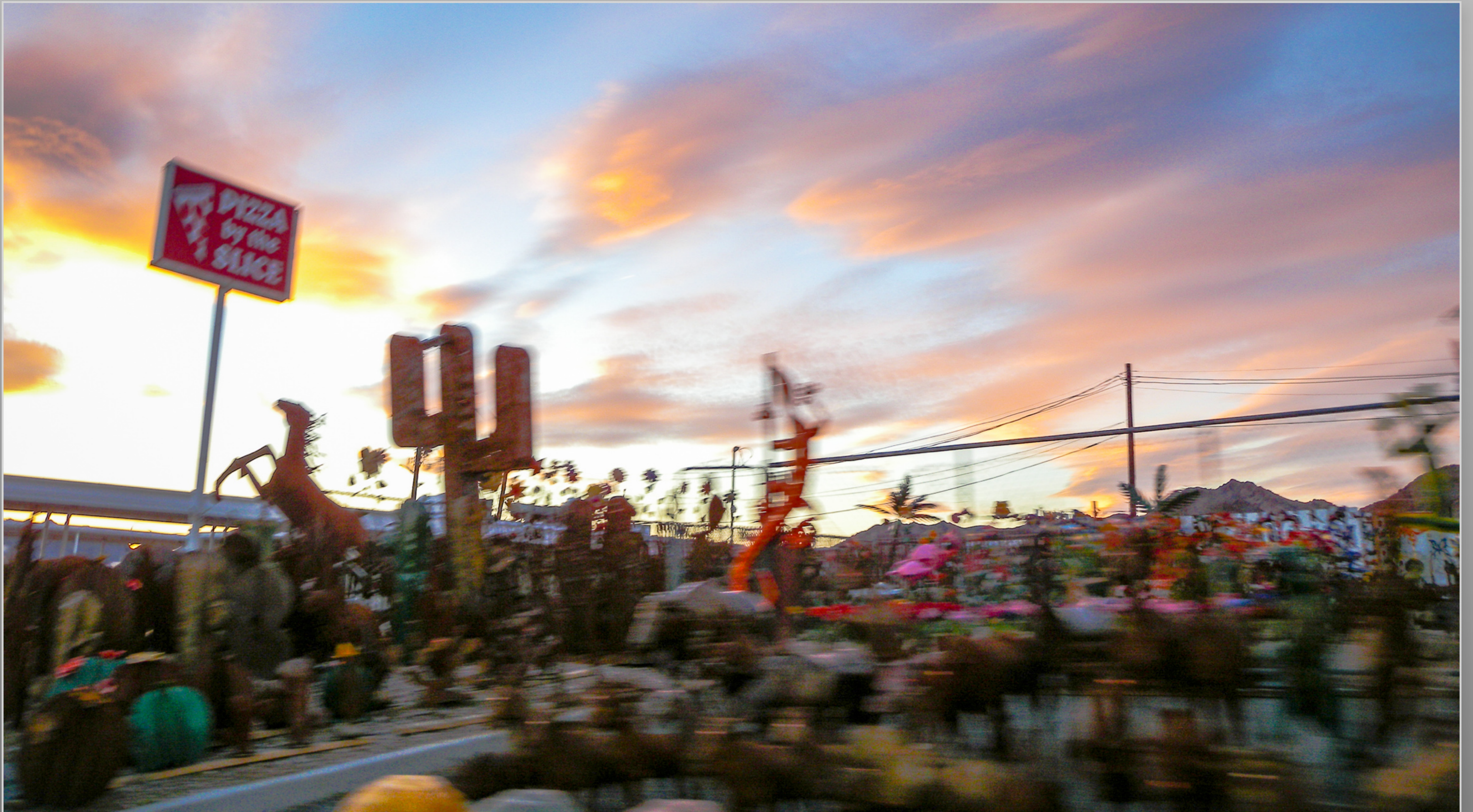
A Slice of Life...a great moving capture with lots of outdoor art at sunset