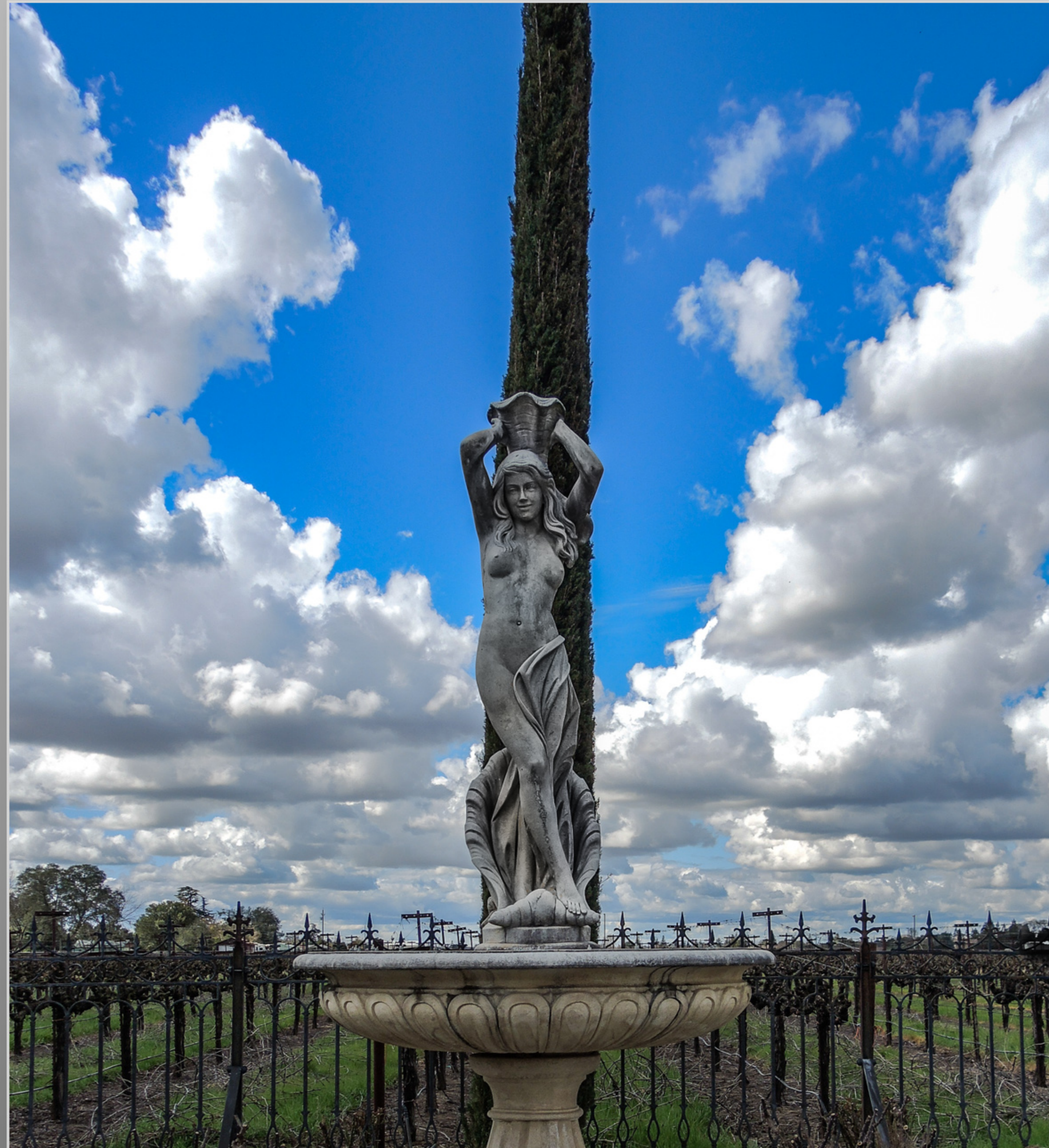
Lost In The Vineyard Dream...composition, and being at the right place at the right time with the clouds