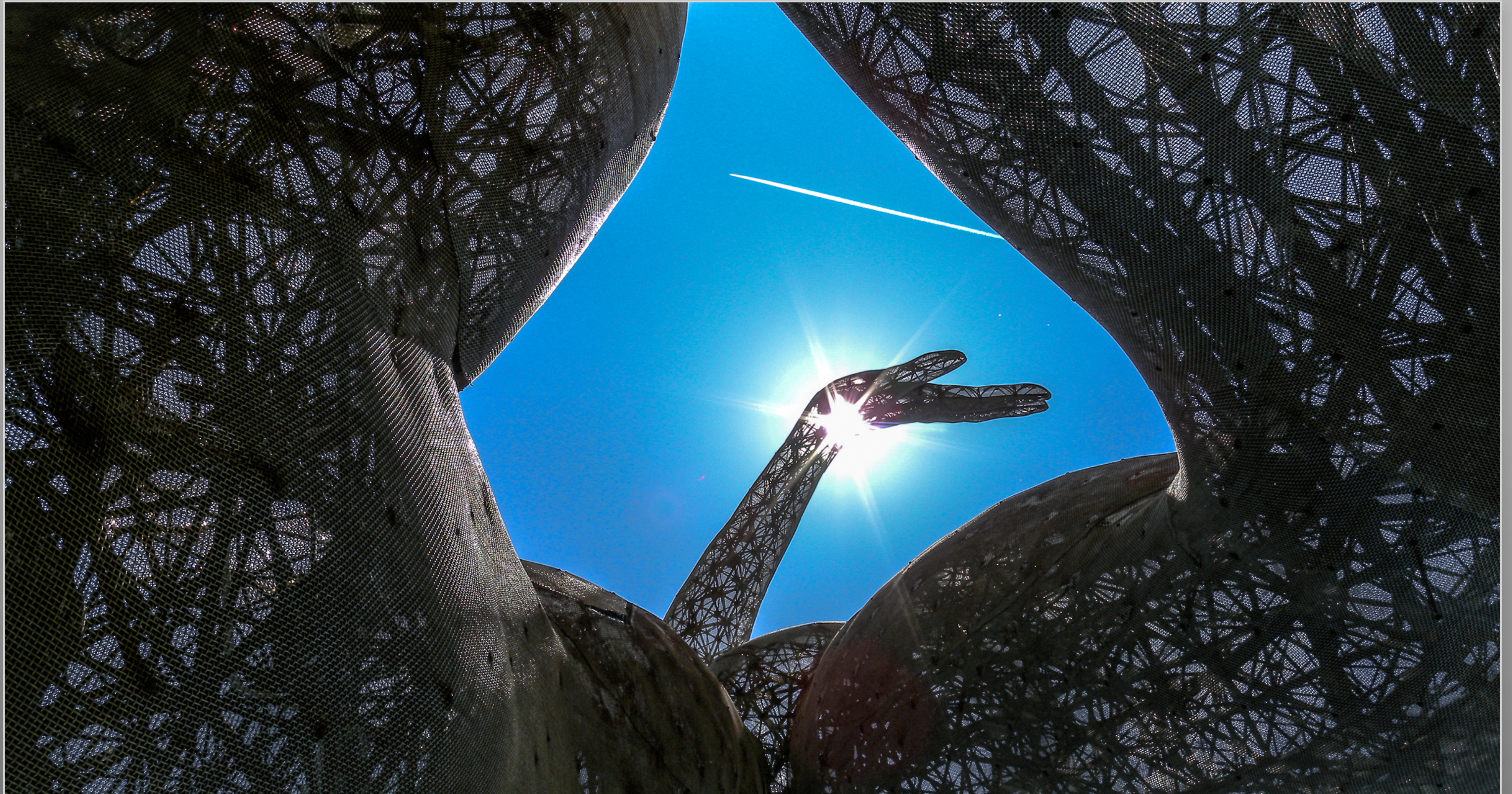
Wired Woman...my position under the sculpture, the addition of a jet engine contrail, and the position of the hand shading the sun creates unusual perspective