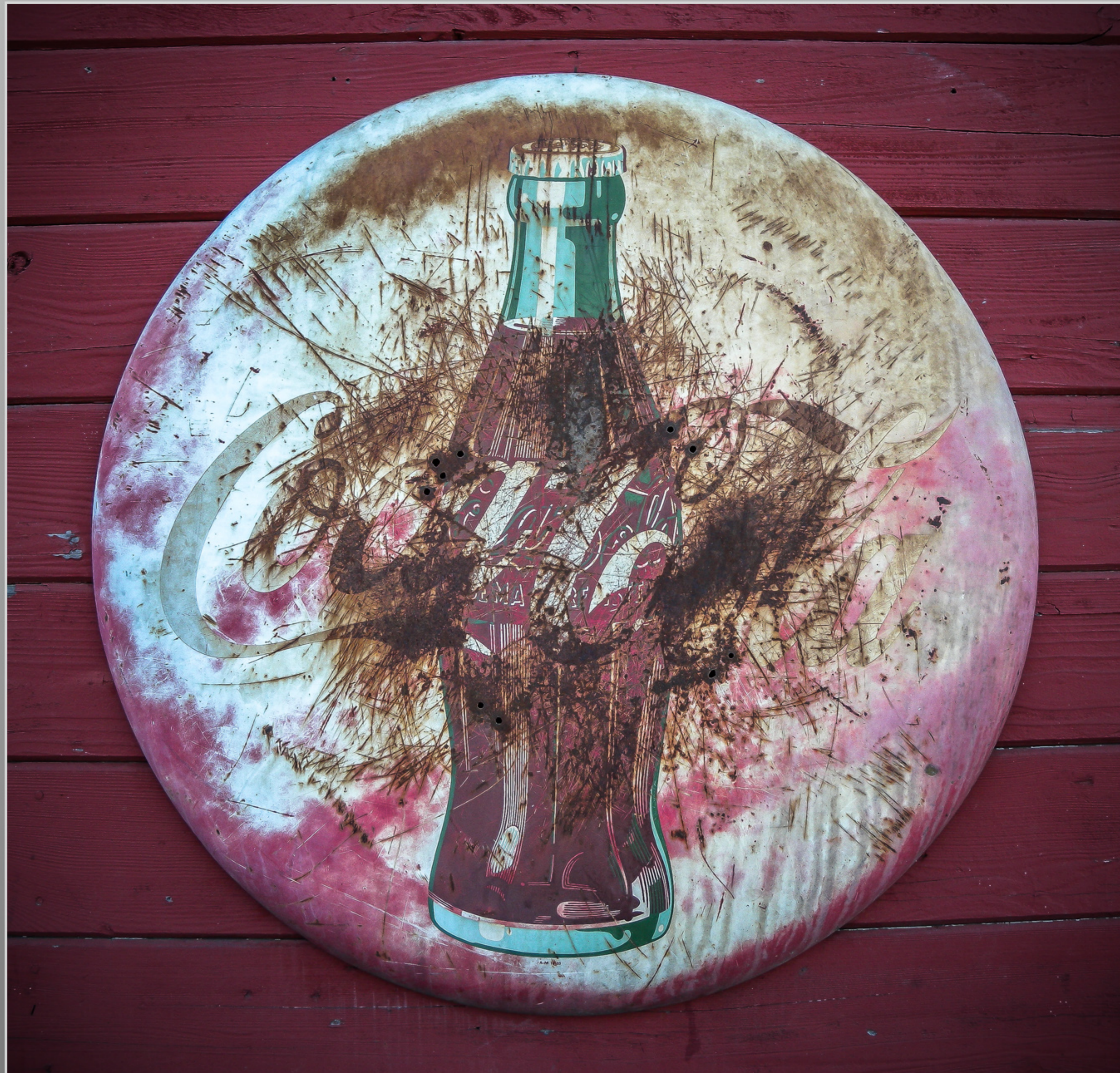
Coke Button...waiting over 70 years for Mother Nature to age the sign, and 3D effect attained with Lightroom