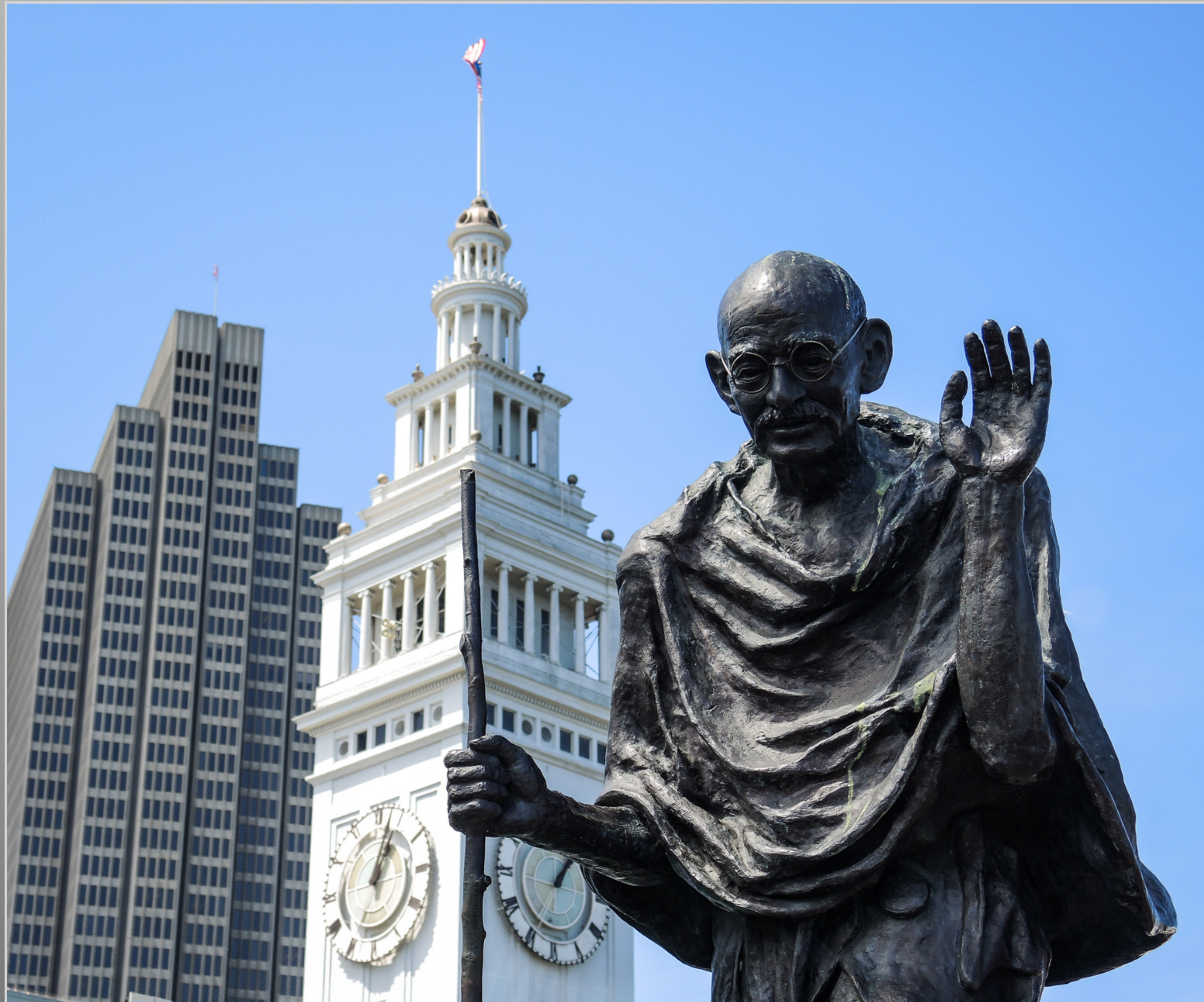
Gandhi In The City...composition of three, my position with the clock tower and staff, and a telephoto gaze from Gandhi to me