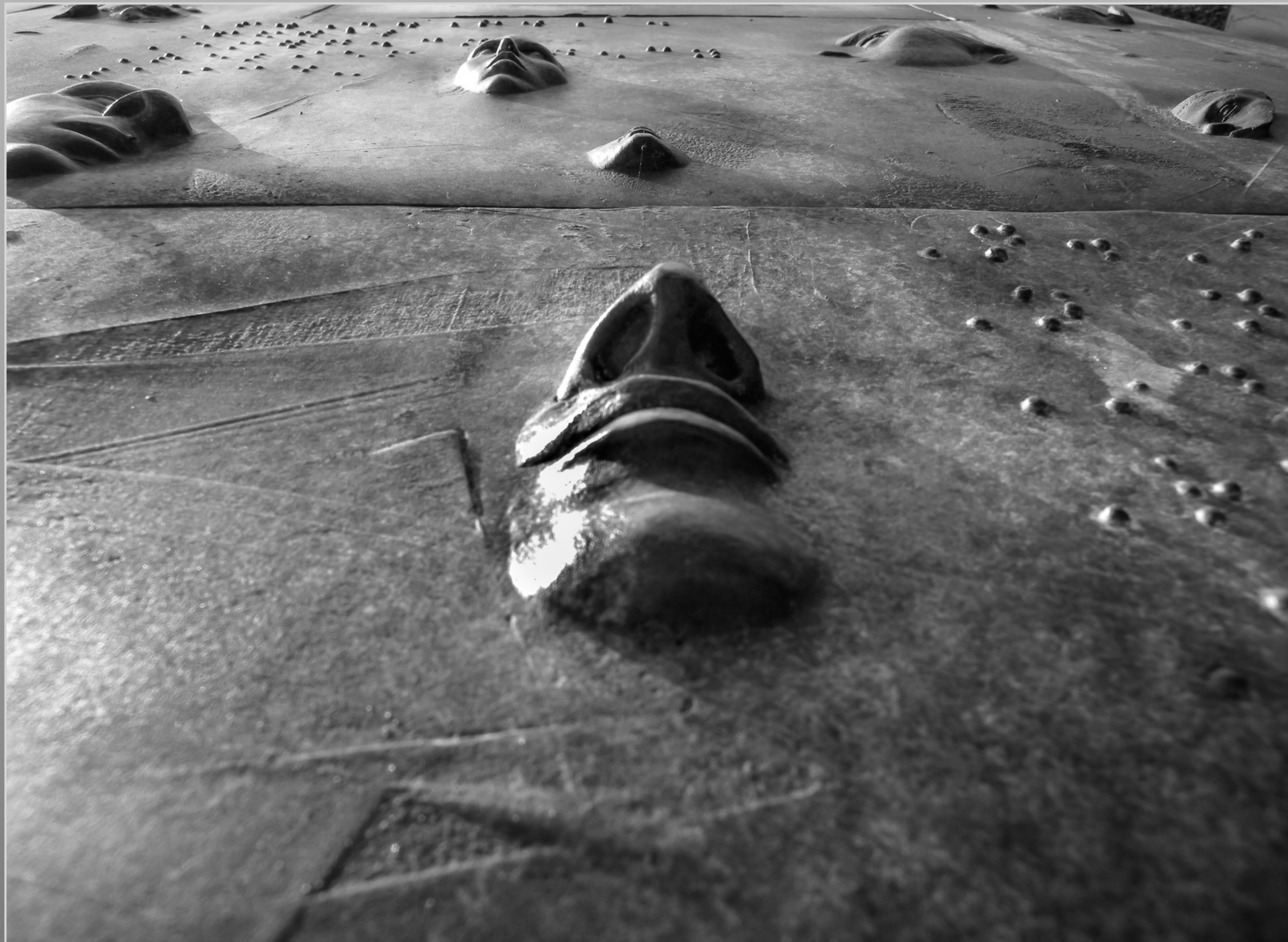
Faces Above water...resting the camera on the sculpture and shooting up changes the perspective, plus a switch to mono